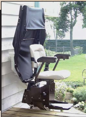
OUTDOOR ELECTRA-RIDE™ ELITE Model SRE-2000E

Home accessibility solutions and automotive products