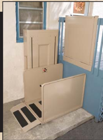
VERTICAL PLATFORM LIFT

The only 400 lb/181.8 kg capacity outdoor stairlift... an INDUSTRY EXCLUSIVE!