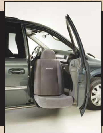
TURNING AUTOMOTIVE SEATING™ (TAS™)

Founded over 20 years ago, Bruno Independent Living Aids, Inc., is a world-wide manufacturer of accessibility products designed to enhance the lives of those challenged by limited mobility. In pursuing this goal, Bruno is proud to be the only U.S. manufacturer of indoor/outdoor stairlifts, interior/exterior scooter, powerchair and wheelchair vehicle lifts and Turning Automotive Seating™ (TAS™) products to be ISO 9001 Certified. This is one of the most stringent, widely-recognized quality standards in the world and your assurance that Bruno is committed to providing you with the highest-quality, most reliable products in the industry. Ask your certified Bruno dealer for details on all Bruno independence products.