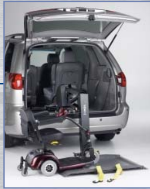
JOEY™ INTERIOR PLATFORM LIFT VSL-4000