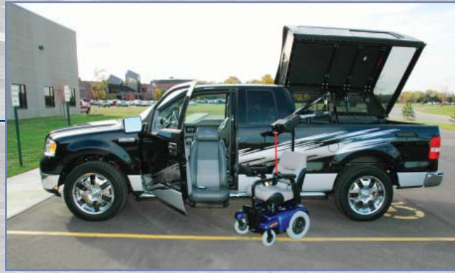
OUT-RIDER™ LIFT W/ POW'R TOPPER PACKAGE