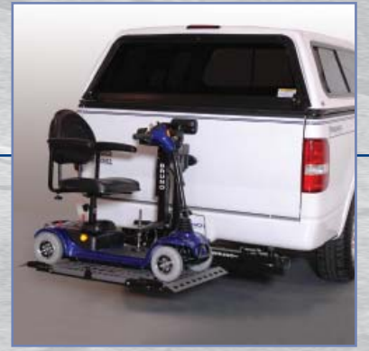
OUT-SIDER® MERIDIAN™ LIFT ASL-250