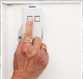
The two wireless call/send controls make the installation simple and clean with no wires running along the wall.

Easy on-and-off thanks to the Electra-Ride II's unique design.