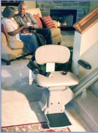
ELECTRA-RIDE™ LT Model SRE-2750