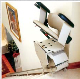
The arms, seat and footrest flip up, creating plenty of space for guests to walk up the stairs.