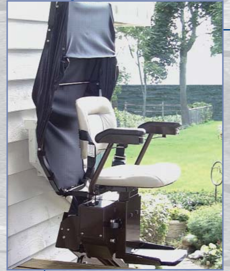
OUTDOOR ELECTRA-RIDE™ Model SRE-2000E The only 400 lb/ 181.8 kg capacity outdoor stairlift... an INDUSTRY EXCLUSIVE!