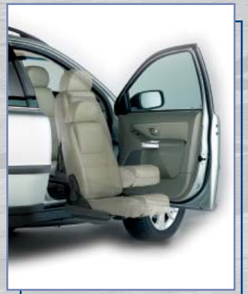
TURNY™ ORBIT® SEAT

Revolutionary Turning Automotive Seating™ (TAS™)